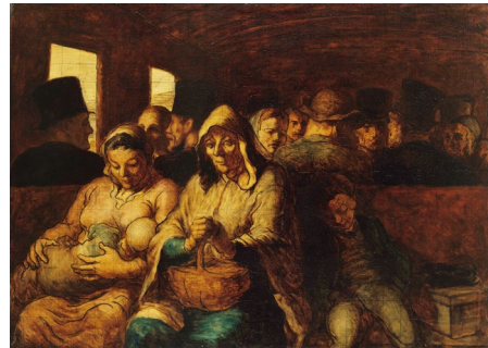
Honoré Daumier, The third class carriage , 1862-1864 New York, The Metropolitan Museum of Art