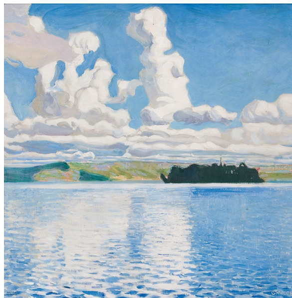
Akseli Gallen-Kallela, Pivornit / Moln / Clouds , 1904 Helsinki, Didrichsen Museum