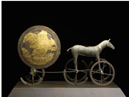
The Trundholm sun chariot, Nordic Bronze Age Copenhague, National Museum of Denmark

THE FESTIVAL IS OPEN TO ALL. ACCESS IS FREE